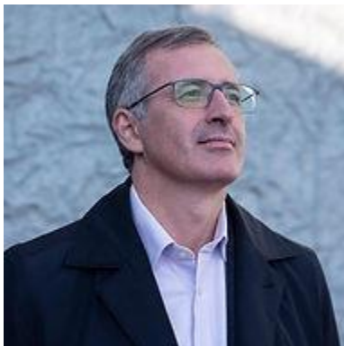
Dr. Sergei Guriev