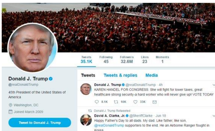
Donald Trump’s public profile image on Twitter (20/06/2017)

Nowadays, the term “fake news” has become ubiquitous to the extent that it conveniently used in an accusatory manner, to denounce or belittle any uncomfortable or inconvenient facts. President Trump has frequently labeled real, verified news from mainstream outlets as “fake news” – a step further from what any other politicians have done in the past, despite the fact that many US presidents have had a complicated and adversarial relationship with the press . In 1962, Nixon partly blamed the press for his loss in the elections for governor of California. Subsequently, once president, he created the White House Communications Office to ensure his interactions with the media were as predictable and orchestrated as possible.